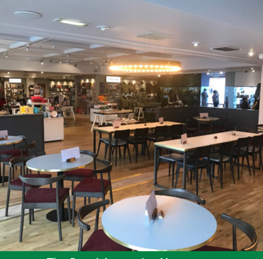
The Royal Armouries Museum

Attractions such as galleries, zoos and museums continue to work with us given our experience in this sector including The Royal Armouries in Leeds, Bristol Zoo and Shetland Museum.