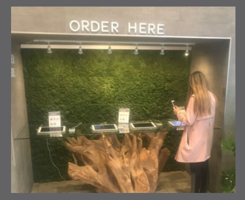
The impact of technology