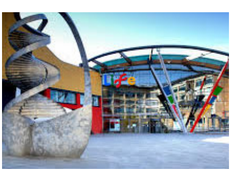
Life Centre Newcastle