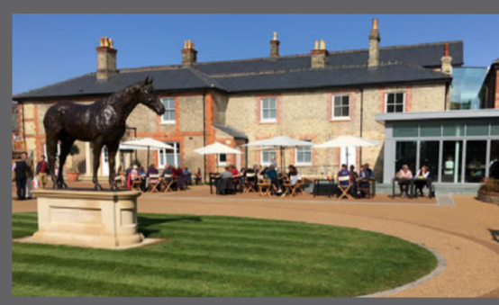
National Centre for Horseracing Museum

Charities operate cafes and at the Reading International Solidarity Centre, Lordship Hub Co-Op Tottenham and the Rosehill Theatre Cumbria we balance some wonderful community work with ensuring the business is sound.