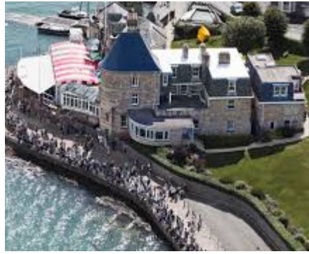
Royal Yacht Squadron

Cafes within farm attractions and garden centres are ever busier and we've assisted Rand Farm Park , Finkley Down , Churchfields , Avon Valley and Fonthill to bust queues and transform their catering from 'good' to 'great'.