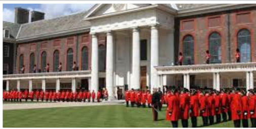
Royal Hospital Chelsea

We've undertaken catering projects for Royal Hospital Chelsea , University Hospital Southampton , Universities of Bristol and Birmingham and continued supporting Aston University , on student and conference centre catering.