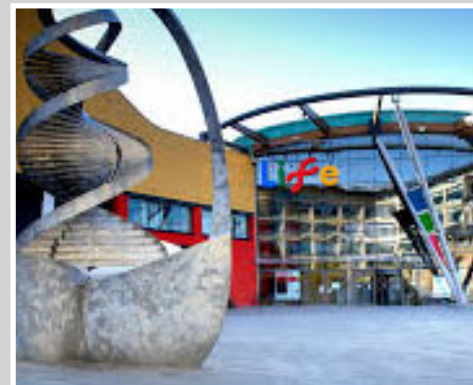
Life Centre, Newcastle