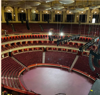
Royal Albert Hall

We have supported The Royal Albert Hall, Pitlochry Theatre, Bath Preservation Trust, Braintree Museum, Gallery Library and Museum Kettering and Charterhouse in developing their future strategic plan and future developments.