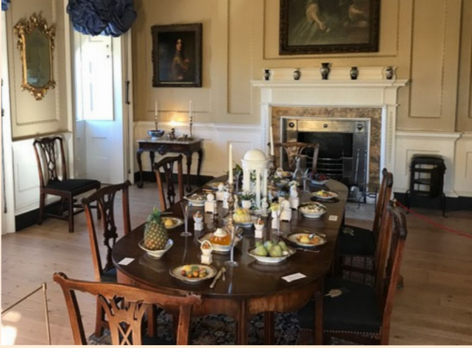
Bath Preservation Trust