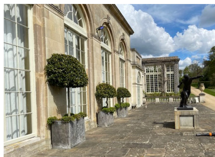
Woburn Sculpture Gallery

We have been called in by a number of estates - Whatton House, Highgrove, Sandringham, Scone Palace, Holkham, Woburn, Wells House Ireland and Beaulieu - as they seek to reorganise